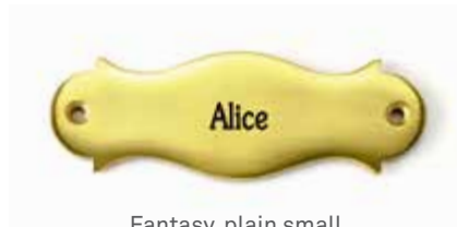
Fantasy, plain small 3 3/4" x 1 4/16" x 3/16" 22093