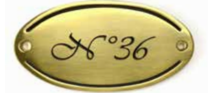
Oval with edging ribbon 4" x 2 1/16" x 2/16" (USA) 22088