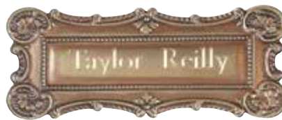
Antiqued brass rectangle plate 2 9/16" x 1" x 1/32" 36005