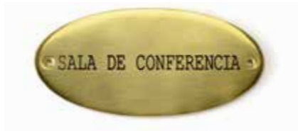
Oval plain 5 5/16" x 2 1/2" x 2/16" (USA) 22091