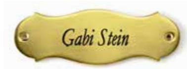
Fantasy, plain large 4 5/8" x 1 5/8" x 1/8" 22096