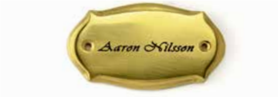
Oval, fantasy 3 7/16" x 2 1/16" x 2/16" (USA) 22090