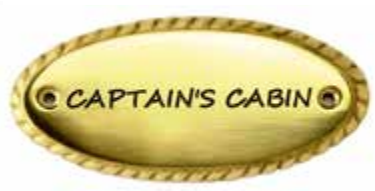
Oval with twisted edging 1 3/8" x 2 9/16" (USA) 22089