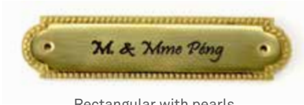
Rectangular with pearls 5 1/8" x 1 1/4" x 3/16" (Imported) 22092

All door plates have a varnished surface to protect against oxidation. All door plates, except model 22095, are delivered with screws.