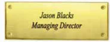
Rectangular plain 6 1/4" x 2 6/16" x 1/16" (USA) 22094