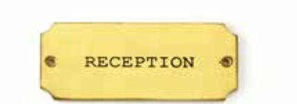
Rectangular, plain with cut corners 4 2/16" x 1 9/16" x 1/16" (USA) 21812