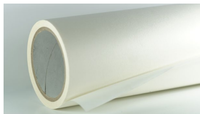
Masking paper ref. 45897