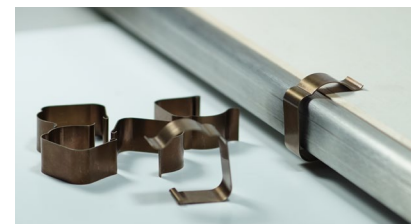
Clamps (pack of 6) ref. 83366